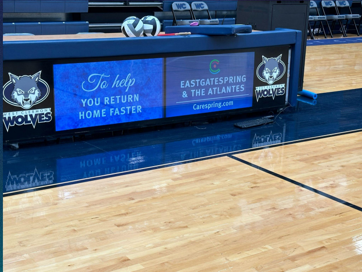
TV Screens on Scores Table rotating ads in competition gym

Permanent & rotating ads placed on Scoreboard at the football field