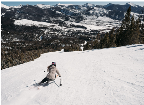
📍 MAVERICK MOUNTAIN