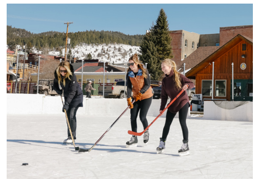
📍 PHILIPSBURG, MONTANA