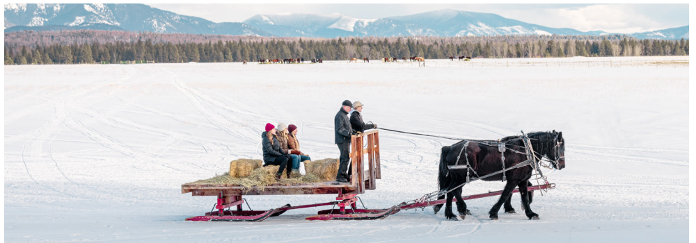
📍 SEELEY LAKE, MONTANA