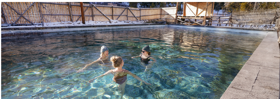
📍 ELKHORN HOT SPRINGS