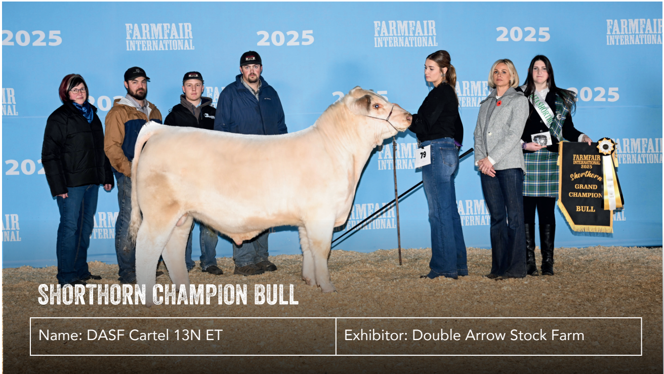
SHORTHORN CHAMPION BULL

Name: DASF Cartel 13N ET Exhibitor: Double Arrow Stock Farm