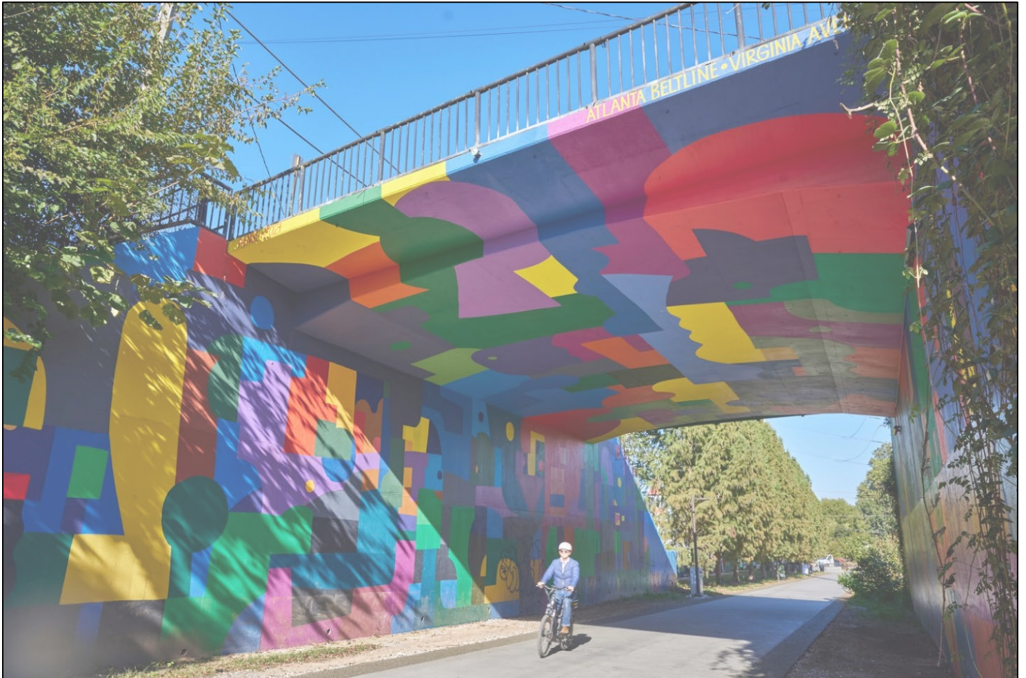
Fig. A1,2 – Artwork Location and Approximate Dimensions