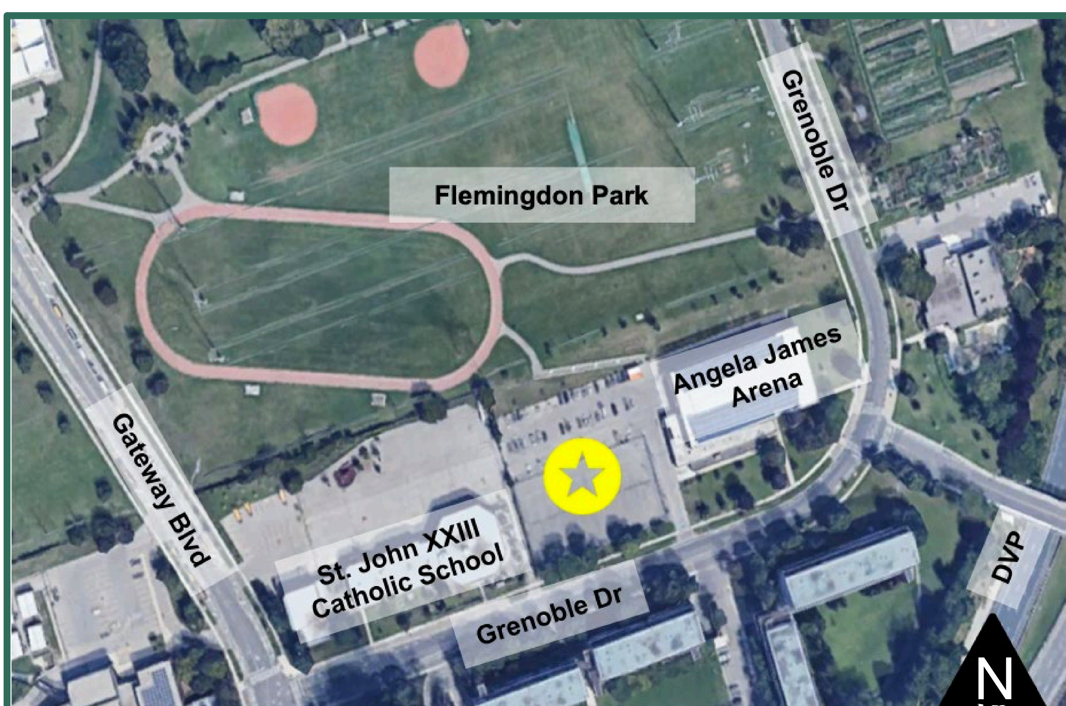
The yellow star identifies the location of the new fire hall at 165 Grenoble Drive.

As part of its work planning for the new fire hall, CreateTO —along with the City of Toronto and Toronto Fire Services—will engage the community to share information and answer questions about the new fire hall.