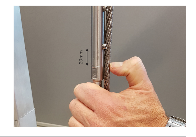
Step 8 Cut the cable using cable cutter to suit 8mm cable.