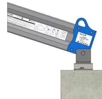
REAR ATTACHMENT - CONCRETE FLOOR MOUNT