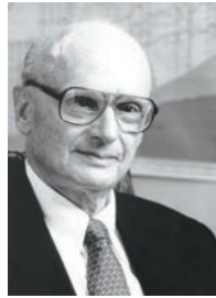
Harry M. Markowitz, PhD

Best known for his pioneering work in portfolio theory, Harry M. Markowitz is a recognized innovator in the fields of finance, economics, and technology. His efforts during the 1950s in creating what is now known as modern portfolio theory—a statistical method for analyzing investment risk and reward—revolutionized the way investments were viewed and evaluated and continues to influence portfolio management today. In 1990, Dr. Markowitz's work was recognized, along with that of William F. Sharpe and Merton H. Miller, with the Nobel Memorial Prize in Economic Sciences.