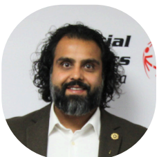
Sunny Deol Golisano Health Leadership Award