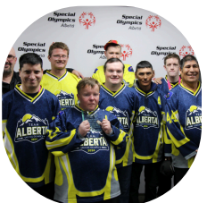
Team Wetaskiwin Floor Hockey Team of the Year