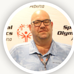
Neil Ivan Athlete Lifetime Achievement Award