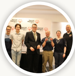
Calgary Comets Team of the Year