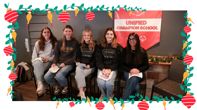
Student leaders came together from Olds, Sunchild, Memorial and Jasper Place High School.

Happy Holidays Champions, and onward we aspire 🎄✨